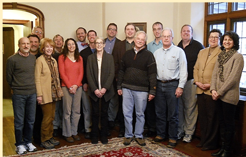
Faculty Retreat, CWRU Squire Valleevue Farm, February 15, 2013

* Except as noted, all faculty appointments are at Case Western Reserve University, and all locations are at MetroHealth Medical Center.