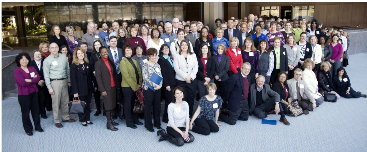
Region-wide Learning Collaborative, Better Health Greater Cleveland 2013

Community-facing programs spawned and supported by the Center illustrate how the Center catalyzes collaboration. These include the CWRU Center for Reducing Health Disparities, Better Health Greater Cleveland , the Northern Ohio Trauma System (NOTS), the Cleveland HIV Health Information Project (CHHIP), and the CDC-sponsored REACH program to reduce health disparities in Greater Cleveland. All of these programs bring competitors together to improve health and the value of health care in the region.